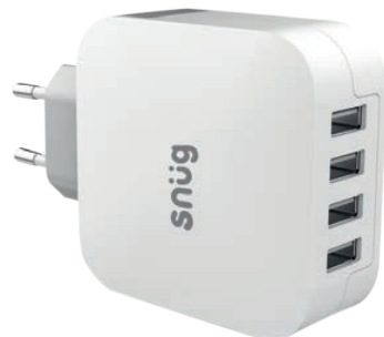
SN0005 - Snug 4 Port USB Home Charger