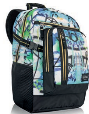
SL7659 - Solo Brooklyn Backpack