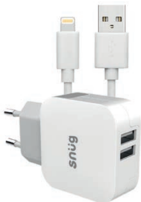
SN0009 - Snug Home Charger With Apple Lightning Charge and Sync Cable