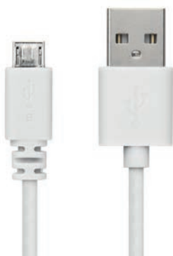
SN0007 - Snug Micro USB Cable