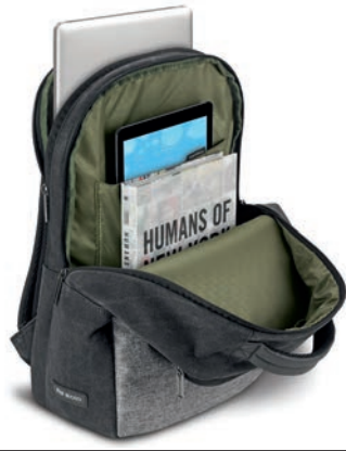
SL7614 - Solo Midnight Backpack