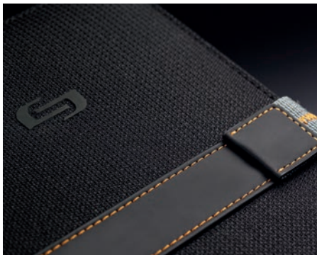
SL2204 - Solo Metro Universal Fit Tablet Case up to 8.5 inch