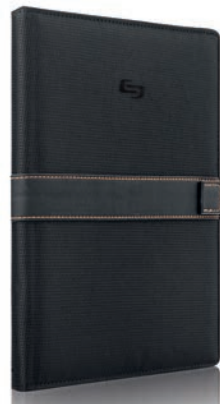
SL2214 - Solo Metro Universal Fit Tablet Case up to 11 Inch