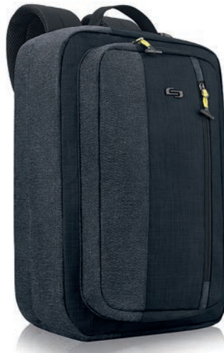
SOLO SOLO VELOCITY HYBRID BACKPACK SL3304