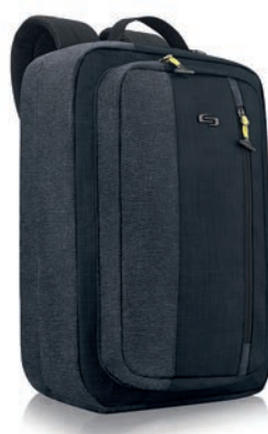
SL3304 - Solo Velocity Hybrid Backpack