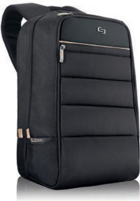
SL7504P - Solo Pro Backpack