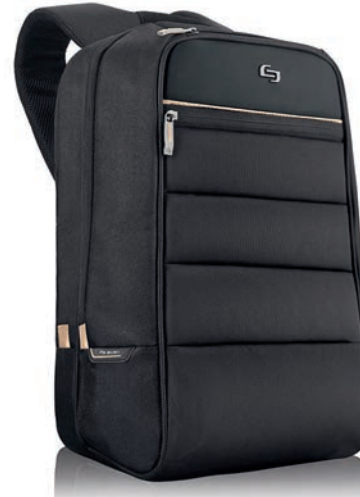
SOLO SOLO PRO BACKPACK SL7504P

*Branding solutions are available for all products.