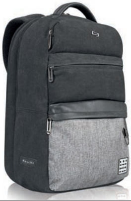
SL7404 - Solo Urban Code Backpack