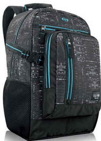
SOLO SOLO MIDNIGHT BACKPACK SL7614