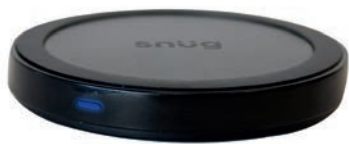
SN0004 - Snug Wireless Charging Pad - 1500 mAh