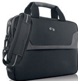
SL1164 - Solo Pro Slim Brief