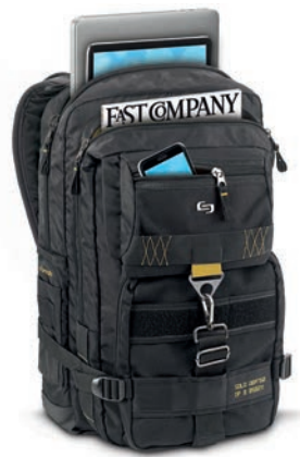
SL7504 - Solo Altitude Backpack