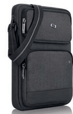
SL21010 - Solo Urban Universal Tablet Sling