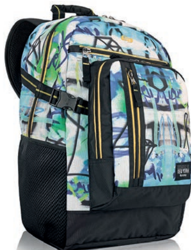
SOLO SOLO BROOKLYN BACKPACK SL7659