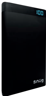
SN0013 - Snug Power Bank - 6000 mAh