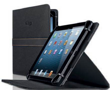
SL2314 - Solo Vector Slim Case

*Branding solutions are available for all products.