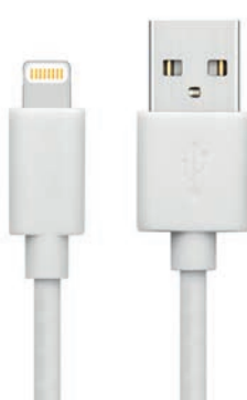
SN0008 - Snug Apple Lightning USB Cable