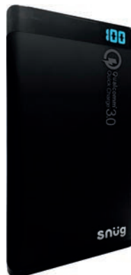
SN0015 - Snug Quick Charge 3.0 Power Bank - 12000 mAh