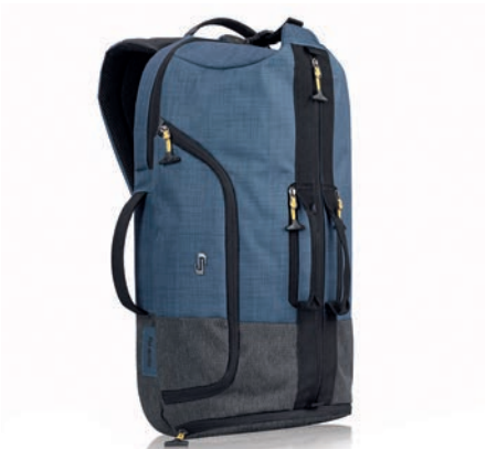
SL7315 - Solo Velocity Backpack Duffel