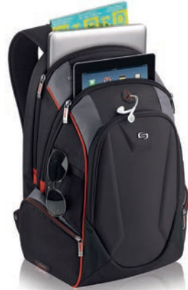
SL7114 - Solo Active Backpack