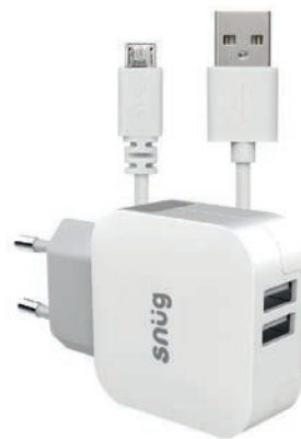
SN0011 - Snug Home Charger With Micro USB Charge and Sync Cable