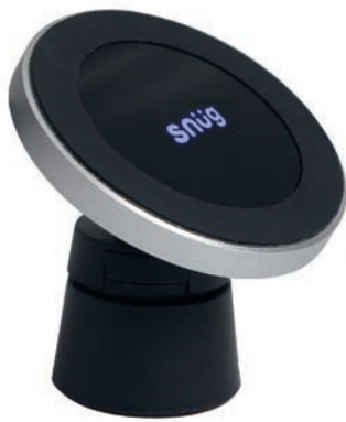
SN0001 - Snug Magnetic Wireless Charger