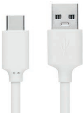
SN0006 - Snug Type-C USB Cable