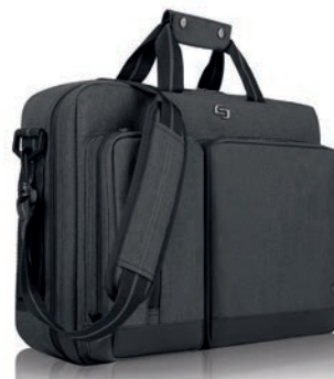
SL31010 - Solo Duane Hybrid Briefcase

*Branding solutions are available for all products.